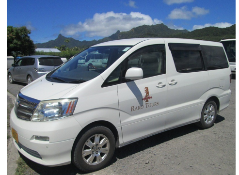
Our Private Tour Minivan

Before ending the tour, our guide will demonstrate and explain the Cook Islands Tree of Life, the coconut. You will learn coconut husking and sample its exquisite flavour.