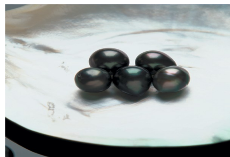
Manihiki black pearls