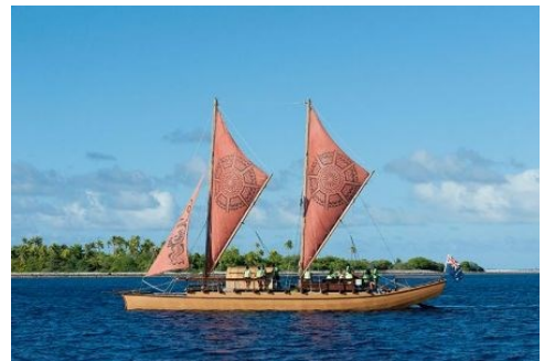
Vaka, typical Polynesian canoe