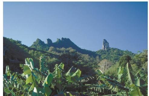
The enchanting inland