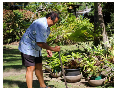
discovering with your driver